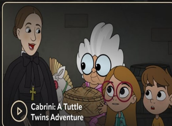
Cabrini: A Tuttle Twins Adventure

Introduce Cabrini To Your Kids In A Family Friendly Way!