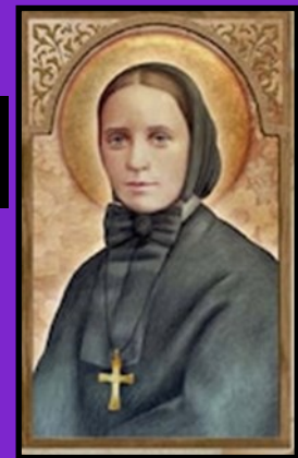
Remember Her Name