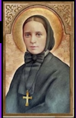
Remember Her Name