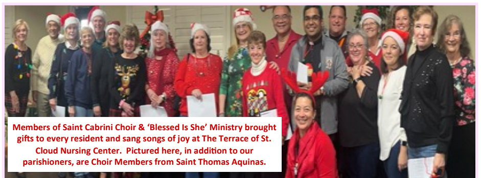
Members of Saint Cabrini Choir & 'Blessed Is She' Ministry brought gifts to every resident and sang songs of joy at The Terrace of St. Cloud Nursing Center. Pictured here, in addition to our parishioners, are Choir Members from Saint Thomas Aquinas.

"Ministering to Lake Nona and the Surrounding Area"