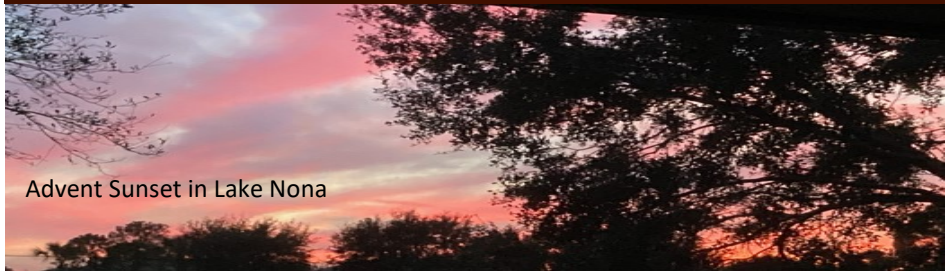
Advent Sunset in Lake Nona

There was a man sent from God whose name was John. He came as a witness to testify concerning that light, so that through him all might believe. He himself was not the light; he came only as a witness to the light. Now this was John's testimony when the Jewish leaders in Jerusalem sent priests and Levites to ask him who he was. He did not fail to confess, but confessed freely, "I am not the Messiah." They asked him, "Then who are you? Are you Elijah?" He said, "I am not." "Are you the Prophet?" He answered, "No." Finally, they said, "Who are you? Give us an answer to take back to those who sent us. What do you say about yourself?" John replied in the words of Isaiah the prophet, "I am the voice of one calling in the wilderness, 'Make straight the way for the Lord.' Now the Pharisees who had been sent questioned him, "Why then do you baptize if you are not the Messiah, nor Elijah, nor the Prophet?" "I baptize with water," John replied, "but among you stands one you do not know. He is the one who comes after me, the straps of whose sandals I am not worthy to untie." This all happened at Bethany on the other side of the Jordan, where John was baptizing. (John 1: 6-8, 19-28)