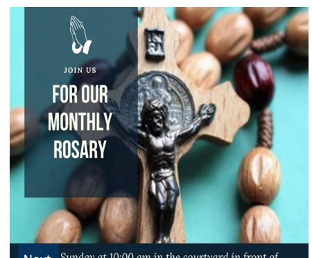
Next Sunday at 10:00 am in the courtyard in front of St Frances Xavier Cabrini Catholic Church

Please Pray for those mentioned in our Online Prayer Book .