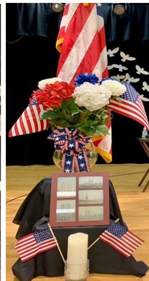
Our Beautiful Art & Environment for the Weekend of September 11th, 2021